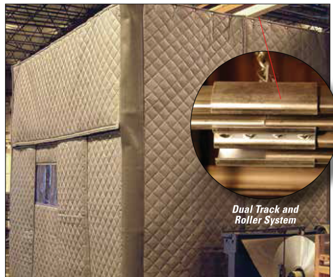
Dual Track and Roller System