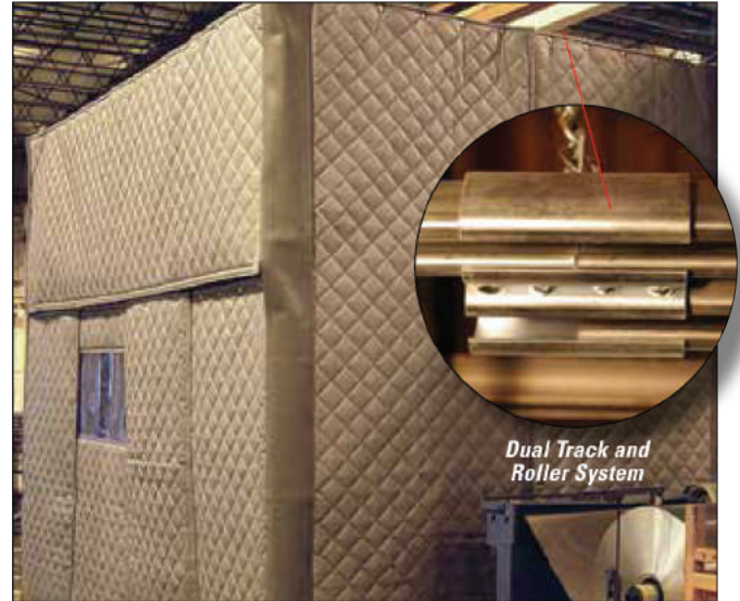
Dual Track and Roller System