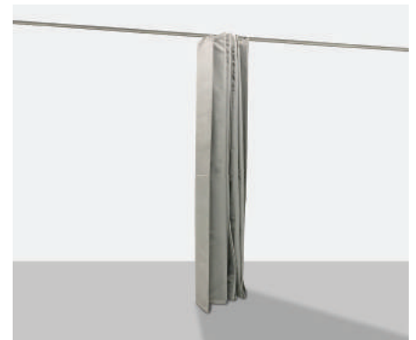
Sound Shield Fold-A-Ways Unique Fan Fold Allows for Easy Storage of Curtains