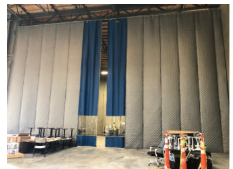
Use As a Warehouse Divider to Block Sound as Well as Dust & Contaminants